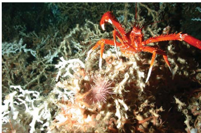
Squat lobster on Lophelia coral off the Southeast U.S..