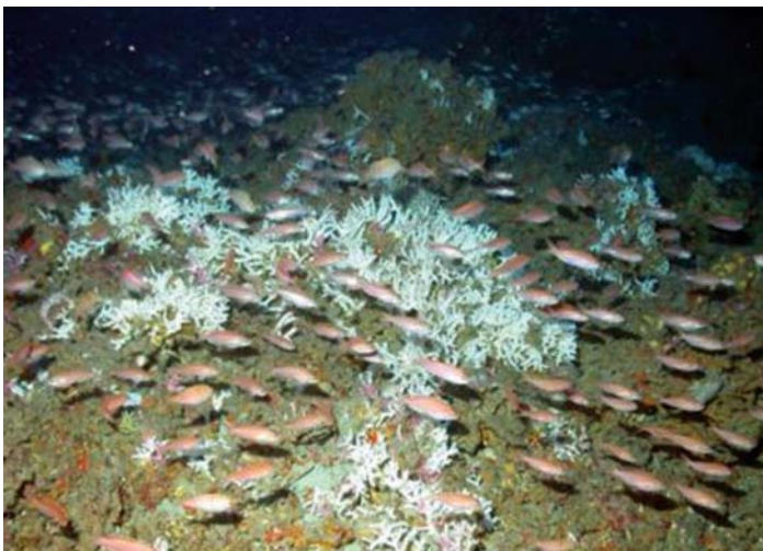
A school of fish among Oculina corals from the Florida Oculina Habitat Area of Particular Concern (2003).