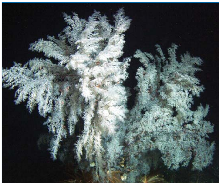
Recently discovered species of black coral called Christmas tree coral, Antipathes dendrochristos . Photographed from Delta submersible during surveys of deepwater rocky banks off southern California.