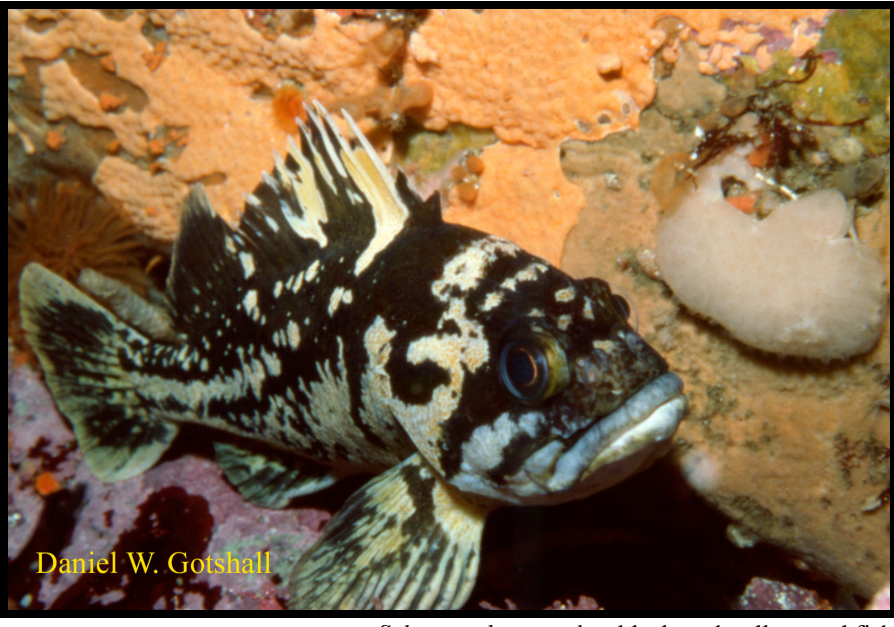
Sebastes chrysomelas, black-and-yellow rockfish