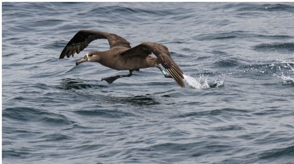
Black footed albatross and other predators, like whales and sea lions, could be affected by impacts to prey due to changing oceanographic processes.

Climate change is altering large-scale processes such as atmospheric circulation and El Niño . During El Niño events, the sanctuary experiences large waves, increased rainfall, reduced upwelling , and warmer water. 61,62 These effects could intensify in the future as the frequency and intensity of El Niño events are expected to increase. 38 The winds that drive upwelling are also expected to become stronger, increasing the frequency and intensity of upwelling, which could escalate ocean acidification. 32,33