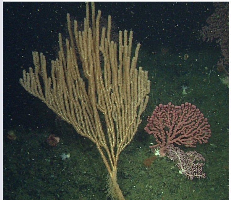
Increasing water temperatures could create conditions that are too warm for some deep water coral communities.

Globally, increasing temperatures are the primary cause of sea level rise through melting glaciers and thermal expansion of seawater. 1 Rising waters could threaten coastal habitats in the sanctuary including the salt marshes of Elkhorn Slough, 24 which are important for coastal protection and carbon sequestration , and beaches that are critical nesting and haul-out habitat for mammals like northern elephant seals and sea birds like the threatened western snowy plover . 25