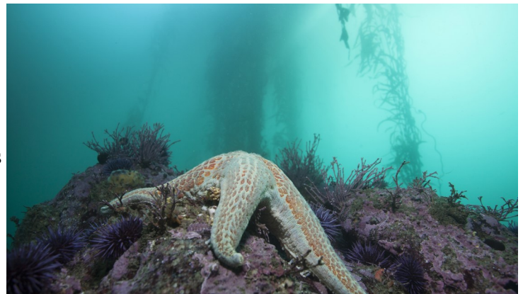
Sea stars are just one of the many organisms that could be impacted by rising water temperatures.

Rising temperatures and marine heatwaves can cause mortality events of intertidal organisms, such as mussels and oysters, and may increase the incidence of sea star wasting disease. 5,6 Further, warmer waters hold less oxygen and may cause oxygen concentrations to fall below the range of natural variability by 2030, 7 reducing habitat for rockfishes 8 and negatively affecting deep water corals . 9 Warming waters may also reduce the survival and reproduction of kelp 10,11 and create conditions that are too warm for some deep water corals. 12 Warming may force species in the